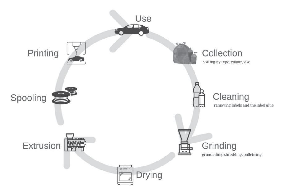
FIGURE 6.1 The basic steps of converting waste to 3D-printed products (Oyinlola et al., 2023)

A schematic of the process of converting plastic to 3D products is presented in Figure 6.1. First, the plastics are collected and sorted based on type to ensure each batch is homogeneous. The sorting is followed by cleaning, which involves removing labels and the label glue, washing and rinsing. This process ensures that