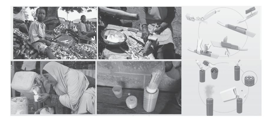
FIGURE 6.3 Examples of 3D-printed products supporting local practices

internet, the adoption of 3D printing can transform the limited access to vital surgical services due to lack of facilities and basic equipment. Several scholars have highlighted the benefits that 3D printing can bring to health care in Africa. Abegaz (2018) noted that 3D technology can bring unprecedented comparative advantages to the health care in Africa. Liaw and Guvendiren (2017) reviewed the applications of 3D printing in medicine and highlighted that current application includes production of medical devices, anatomical models and drug formulation, dentistry and engineered tissue models. They noted that dentistry was one of the advanced fields with application in areas such as restorations, dental models and surgical guides. Another area of wide application of 3D printing is medical devices (both implantable and non-implantable products) such as bone tether plates, hip cups, spinal cages, knee implants, denture bases, craniofacial implants and surgical instruments (Liaw and Guvendiren, 2017).