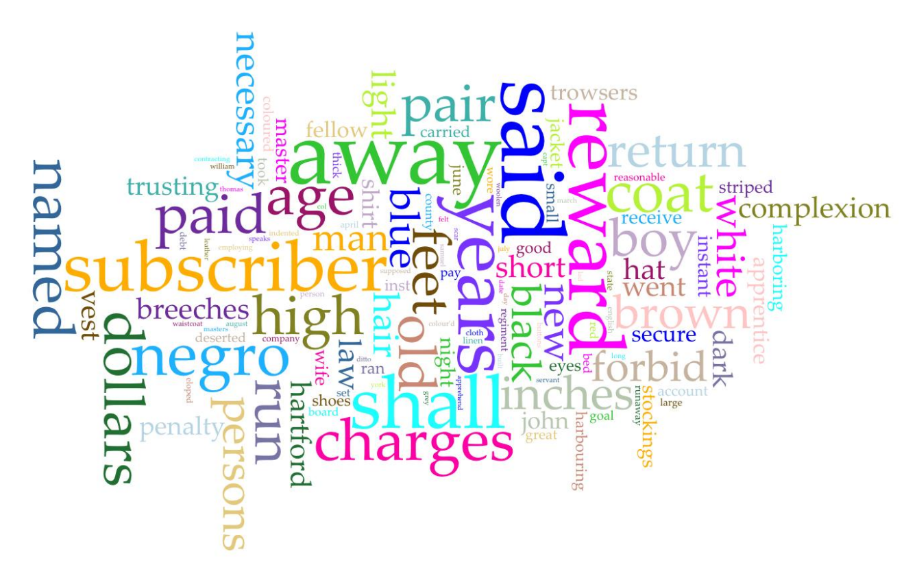
Fig. 3 Visualizing the "the residue of commodification." A word cloud of runaway advertisements generated by the author using Voyant (voyant-tools.org).

a location mentioned in a runaway advertisement.<sup>53</sup> Limited time and resources prevented the implementation of this and other ambitious plans, including genealogical crowdsourcing, primary and secondary school outreach, art installations, and data-linking with other projects.